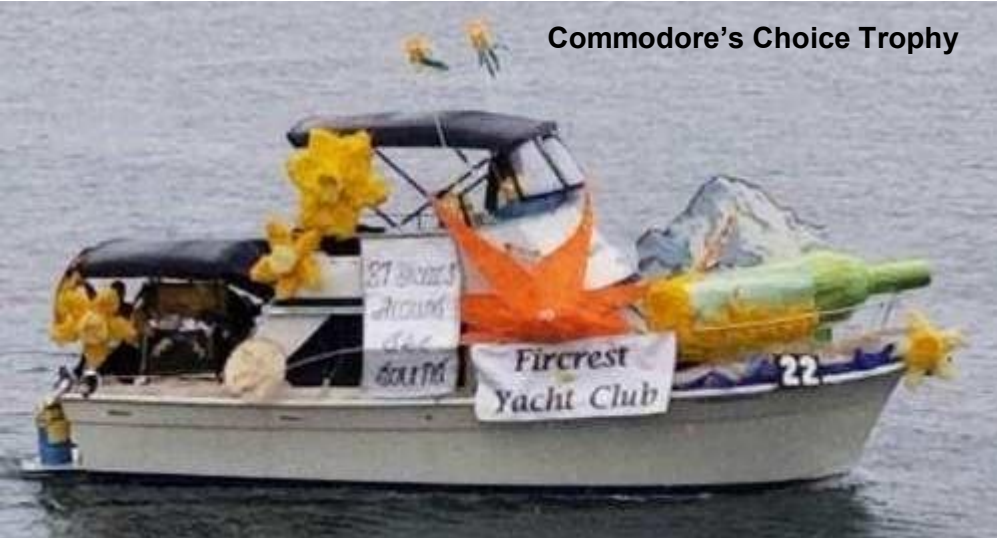
Commodore's Choice Trophy