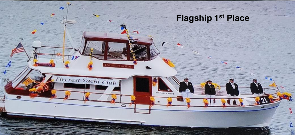
Flagship 1 st Place