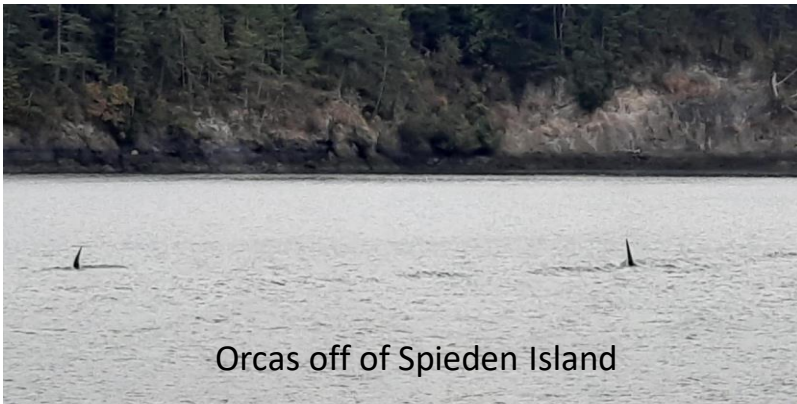
Orcas off of Spieden Island