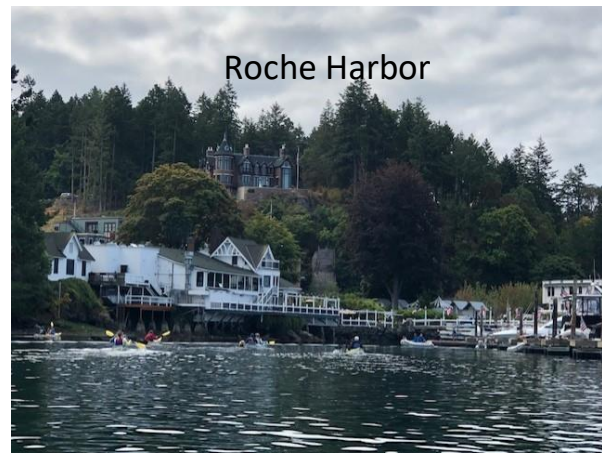
Roche Harbor – Sculpture Park